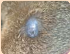
Skin lump on the elbow of a cat

If you do find a lump it is therefore very important we examine it as soon as possible – in order that we may establish the underlying cause and start any required treatment without delay. If you are concerned about a lump on your pet – or any other health problem, don't delay – please contact us today for an appointment!